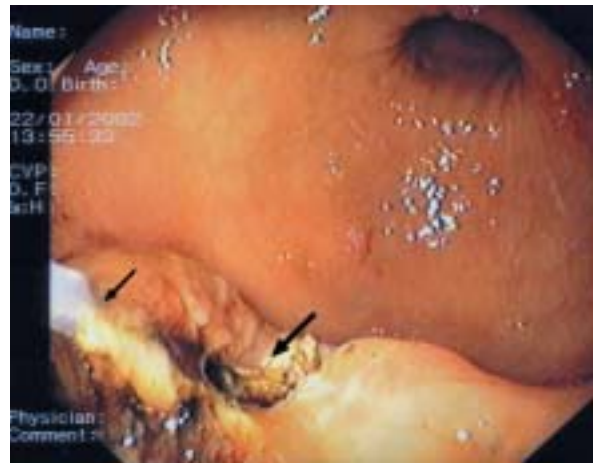
Figure 3. Endoscopic appearance of the stomach immediately after the endoscopic electro-surgical polypectomy (performed 7 days after placement of the first diathermic snare). Note the first snare (thin arrow) and presence of scarce blood, but no bleeding (thick arrow).

during the hospitalization, without occurrence of any complications. Finally, the first polypectomy snare sloughed off spontaneously and slipped out of the nose within 3 days after the endoscopic polypectomy. Histological evaluation of the transected polyp revealed neoplastic cells showing fusiform and epithelioid morphology according to a gastric submucosal leiomyoma (Figure 5 A, B).