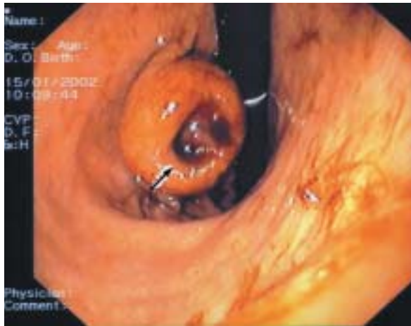
Figure 1. Endoscopic appearance of the giant gastric polyp at the passage from body to antrum. The clot on the top of the head is showed by the arrow.

ing with a clip. The snare was then kept in place passed throughout the nose like nasobiliary tube.