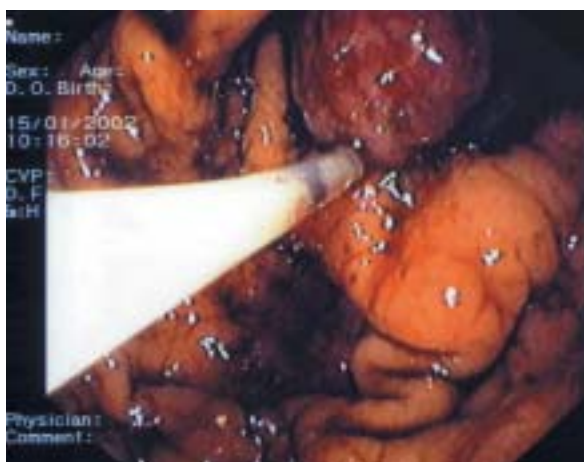
Figure 2. Placement of the first diathermic snare to prevent bleeding.

In the second step, performed one week later, endoscopic polypectomy was performed using a second polypectomy snare. Electrocautery current was supplied by the Söring 600 instrument (Söring Medizintechnik, Quickborn [Germany]), which was set on “blend” at 2. The polyp was transected immediately over the place of the first snare. The first polypectomy snare was kept in place (Figures 3 and 4) and the patient was discharged three hours after endoscopic polypectomy. We evaluated clinically the body temperature and the appearance of thoracic or/and abdominal pain