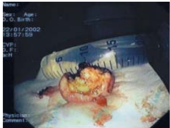
Figure 4. The giant gastric polyp on the table after extraction. Note the impressive size of the polyp compared with a syringe.

Endoscopic control was performed one (Figure 6 A) and four (Figure 6 B) weeks later, showing complete reepithelization of the gastric mucosa. Histological evaluation