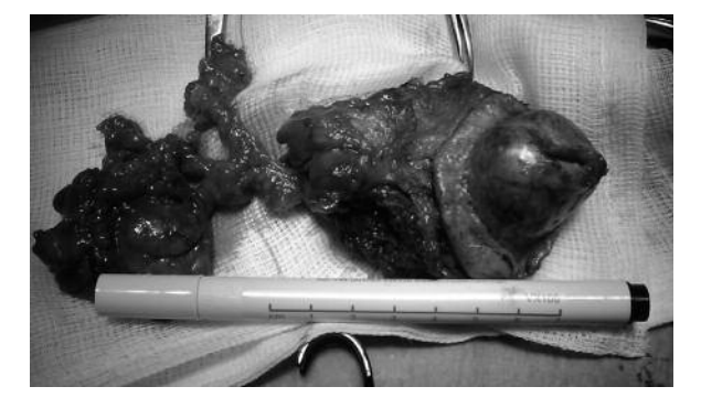
Figure 2. Macroscopic aspect of an excised primary cutaneous mucoepidermoid carcinoma. Note the 7 cm deep infiltration of the lesion.

flammatory infiltration. It is delimited by an epithelium constituted of a mixture of mucous cells, cuboidal intermediate cells and epidermoid cells; sometimes it formed papillary structures. In the pericystic connective tissue small nests of epithelium characterized by mucipar glands and a solid mass of stratified cells were found (Figure 3). The histology of the neck dissection showed metastases to two lateral-cervical lymph nodes at levels I and II. Immunohistochemistry resulted positive for cytokeratin 5/6/7, anti-human epithelial membrane antigen (EMA) and P63 and was negative for cytokeratin 20, S100 and MelanA. The neoplasm was graded as an in-