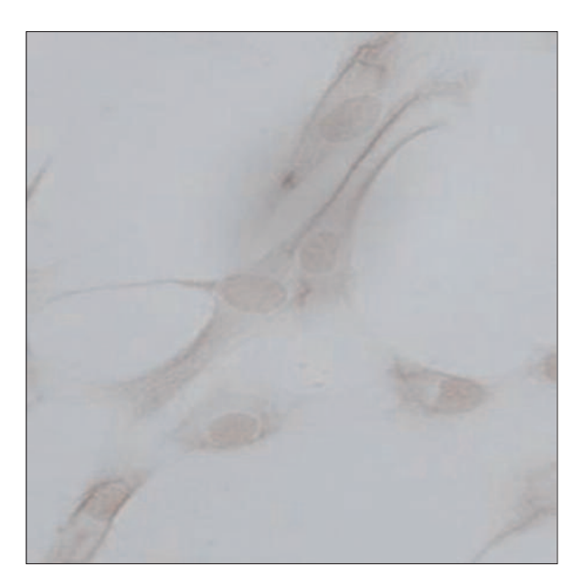
Figure 3. Immunocytochemical staining of collagen II in OA chondrocyte cultures (×400).

could predict greater risk of cartilage loss in OA<sup>11</sup>. IL-6 play an important role during the pathogenesis of OA<sup>8,13</sup>.