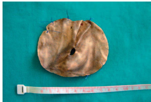
Figure 3. The PTFE Mesh after the removal.