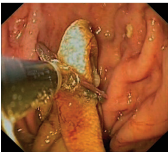
Figure 2. Endoscopic finding of the foreign body: the PTFE Mesh appears as a whitish shrunken material free-moving in the gastric lumen.

in the present case. In conclusion, dysphagia may manifest during the early postoperative period after mesh repair antireflux surgery, but such dysphagia usually resolves; if it doesn't or if it worsens, mesh migration must be excluded.