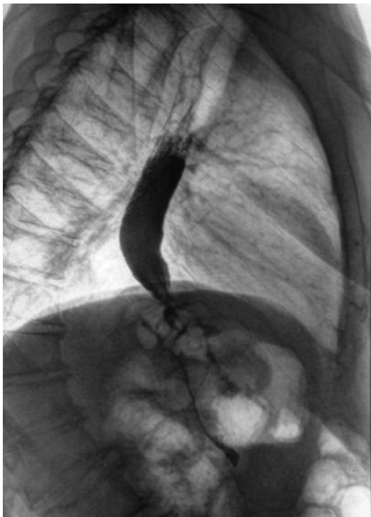
Figure 1. Barium swallow examination: anomalous esophago-gastric transit and hiatal stenosis.

in the present case. In conclusion, dysphagia may manifest during the early postoperative period after mesh repair antireflux surgery, but such dysphagia usually resolves; if it doesn't or if it worsens, mesh migration must be excluded.