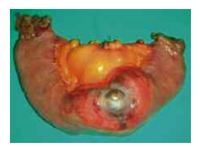
Figure 5. Small bowel GIST.

sion, or by intraperitoneal seeding. Primary tumors of the colon, ovary, uterus, and stomach usually involve the small bowel, either by direct invasion or by intraperitoneal spread, whereas primaries from breast, lung, and melanoma metastasize to the small bowel hematogenously. Melanoma is the extraintestinal malignancy with the greatest predilection to metastasize to the bowel. Surgical resection does not improve prognosis but is sometimes requested in presence of complications<sup>6</sup>.