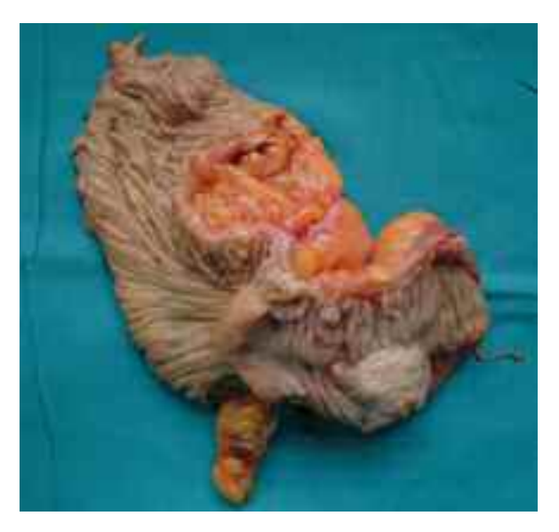
Figure 1. Small bowel carcinoid.

Small bowel, especially terminal ileum, represents the most frequent location of neuroendocrine tumors in the gastrointestinal tract (among 30%)<sup>14</sup>. Peak incidence is between the 6<sup>th</sup> and 7<sup>th</sup> decades of life<sup>15</sup>. Clinical manifestations